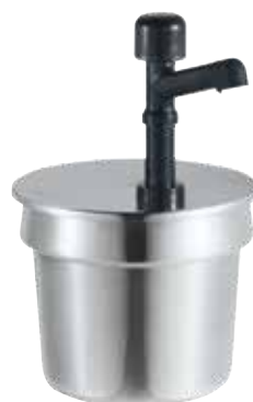
PS-8 1/2 82170