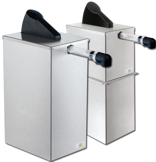
SE-SS 07125 SE-SS 07020